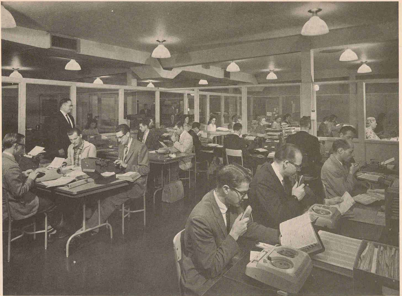
Qualified and thoroughly trained ministers and graduates of Ambassador College assist Mr. Armstrong in answering the thousands of letters needing personal attention.

as the GOD of this world—having DECEIVED all nations —actually SWAYING all mankind by subtle SUGGESTION and INFLUENCE into obeying HIM as a world ruler!