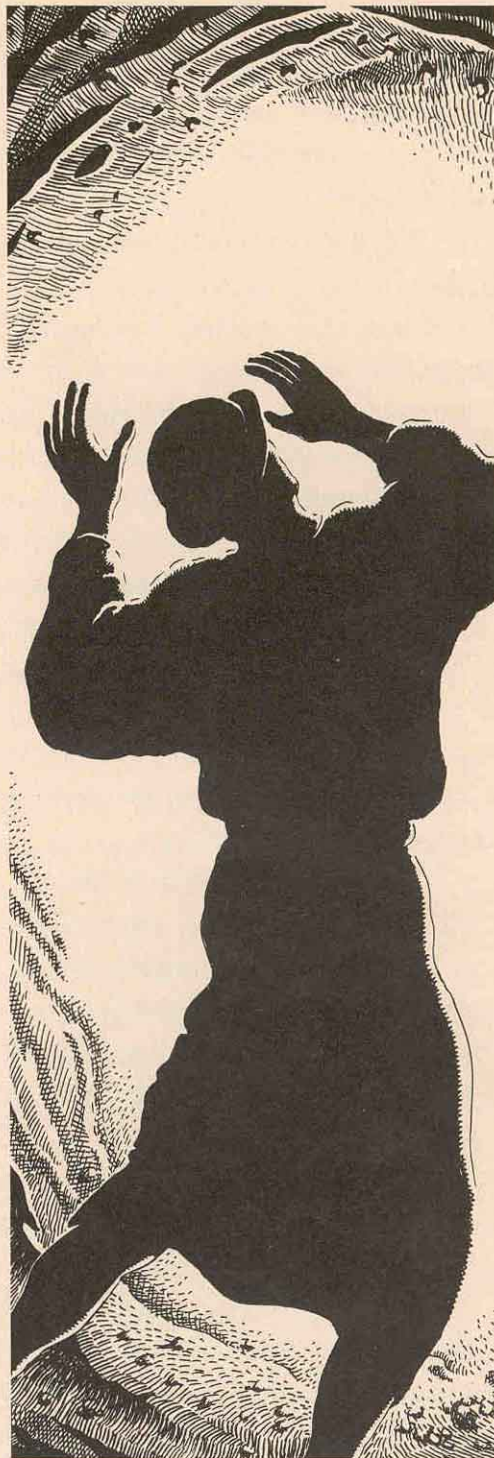
Even before Moses could clap his hands over his eyes the dazzling figure was gone and the brilliant light faded.

God again wrote the Ten Commandments—this time on the stone slabs brought up from the camp. When at last Moses went back down the mountain, he was a happier man than he had been