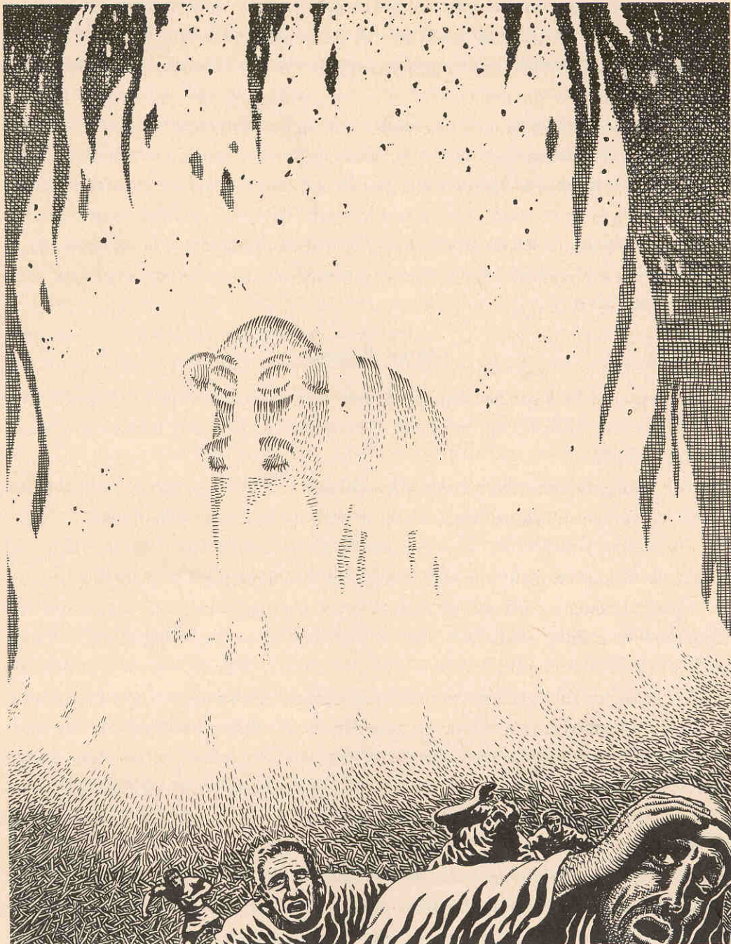
Intense heat from the heaps of burning wood and brush soon melted the golden calf down to the ground.

Most of the Israelites were relieved to see this evil image slowly melt down to the ground. But there were many who bitterly and wrathfully watched their idol go down to such a quick and inglorious end.