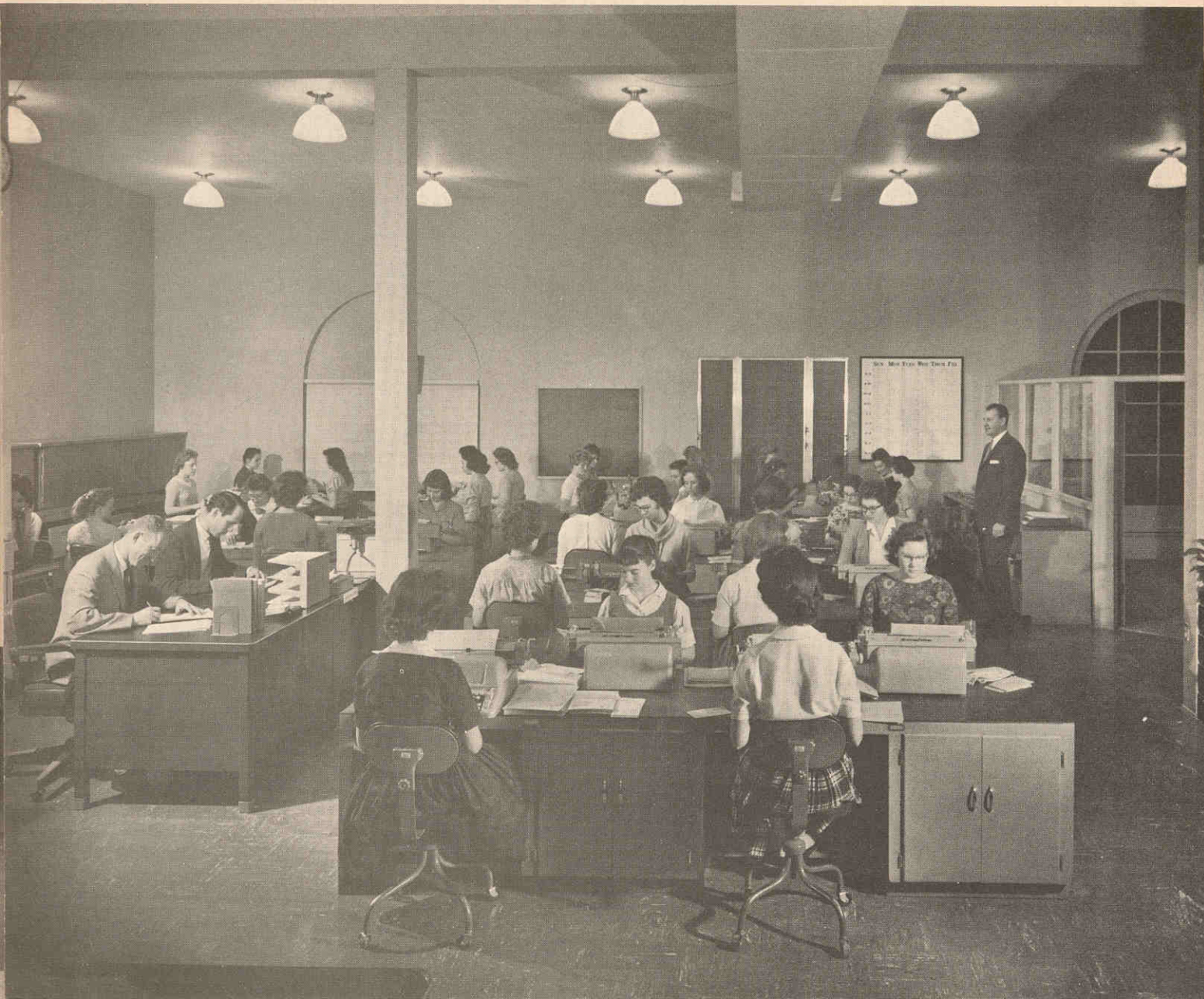
Typing envelopes for the tens of thousands of pieces of literature requested each week. This is only one method by which students help to earn their way through Ambassador College.

the man against this false education, and commanded him not to partake of it! "For," said God, "in the day that thou eatest thereof thou shalt surely die."